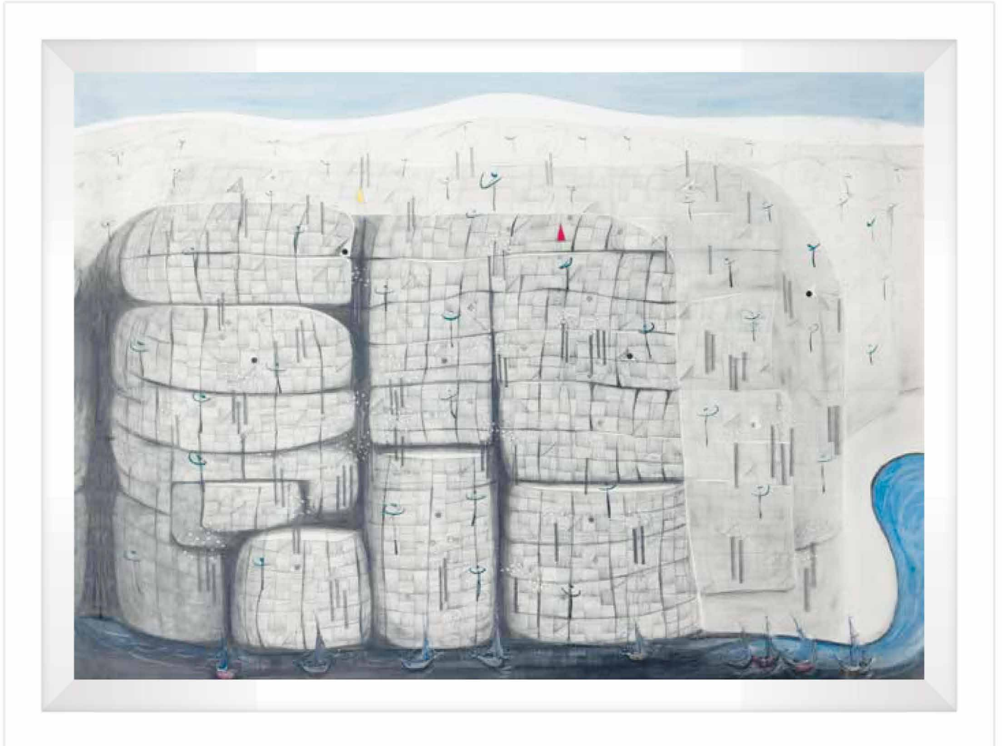
Elephants Crossing the Water Tang Kok Soo