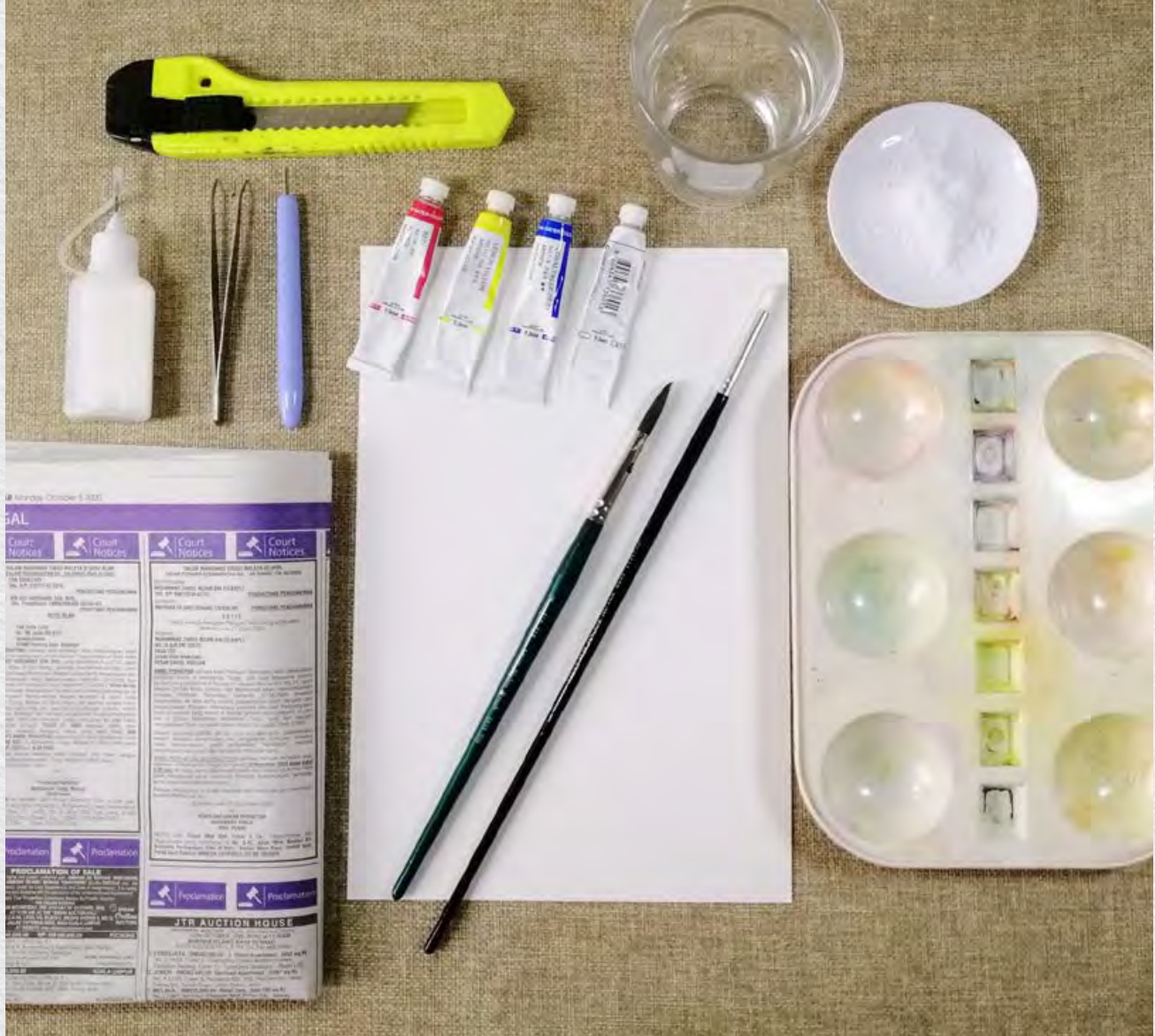
Materials: Newspaper, Glue, Tweezers, Quilling Pen, Penknife, Paper, Paintbrushes, Watercolours, Palette, Water and Salt