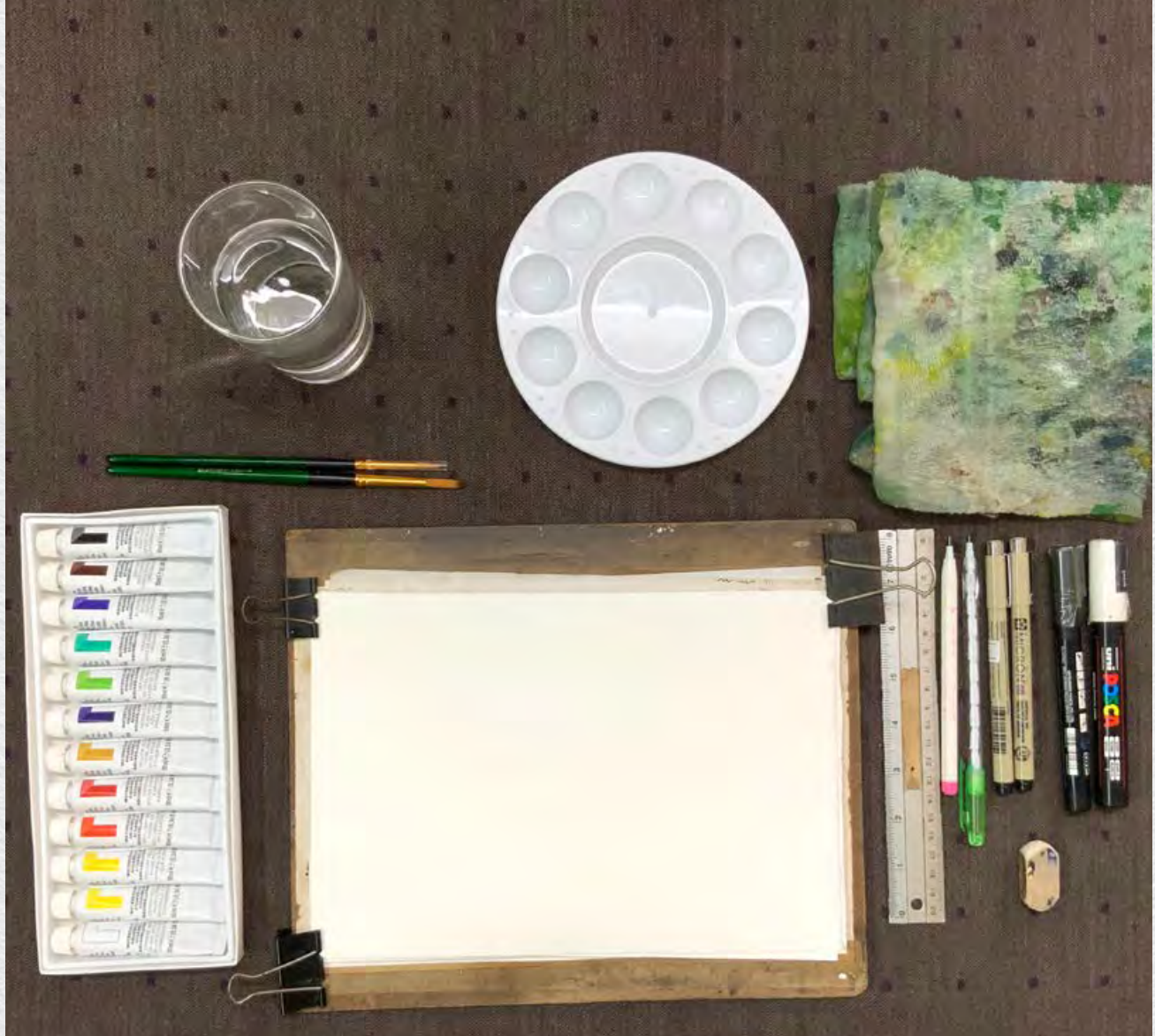
Materials: Paper, Pencil, Eraser, Ruler, Watercolours, Paintbrushes, Palette, Liner Pens, Marker Pens and Water